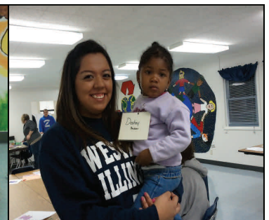
PRAIRIEVIEW FAMILY FUN NIGHT AND HOMEWORK HELP