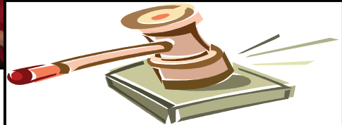
Christmas Party with the Fitch Folks and Officer elections.