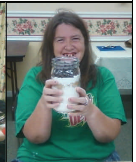
GREENBRIER KID'S MADE COOKIES IN A JAR AT FAMILY FUN NIGHT!