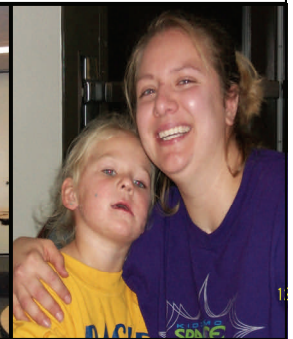
EISENHOWER TOWER CHRISTMAS TREE DECORATING PARTY.